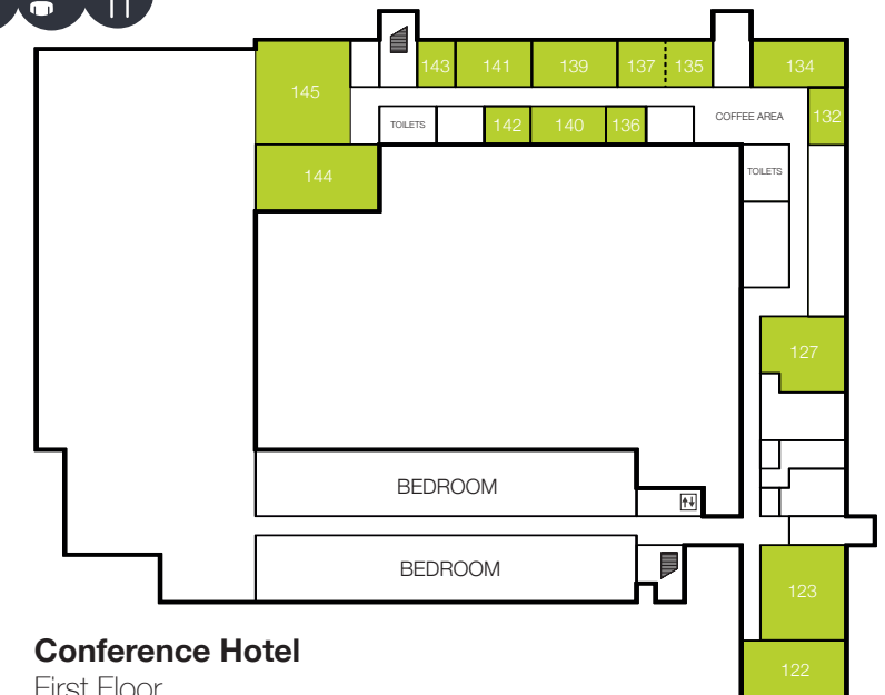
Conference Hotel First Floor